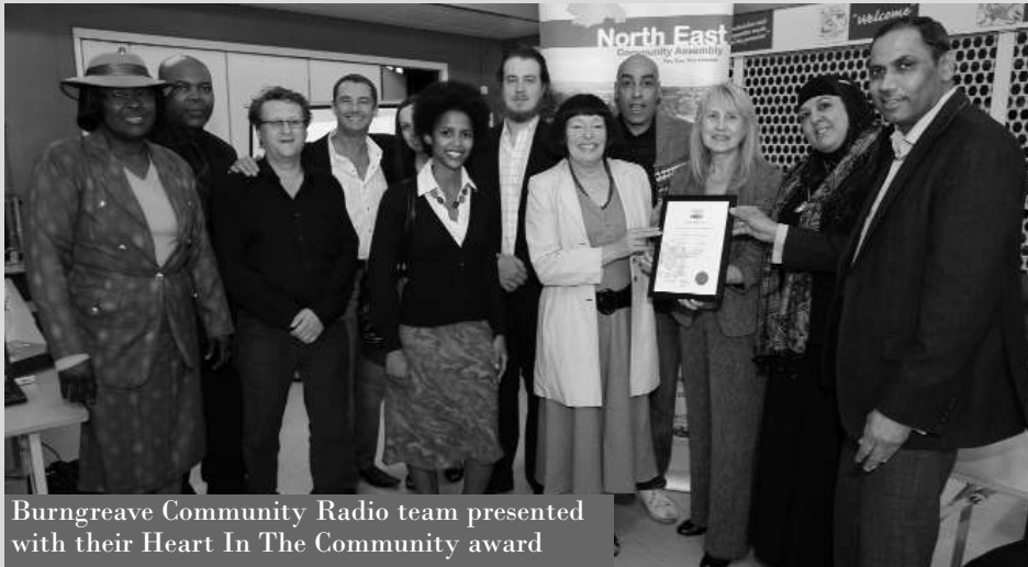
Burngreave Community Radio team presented with their Heart In The Community award

Eighteen individuals and groups were nominated in the Burngreave Ward for a Heart in the Community Award and all of these unsung heroes and heroines were invited to receive their certificates at the Burngreave Area Ward meeting on Thursday 16 June at Fir Vale School.