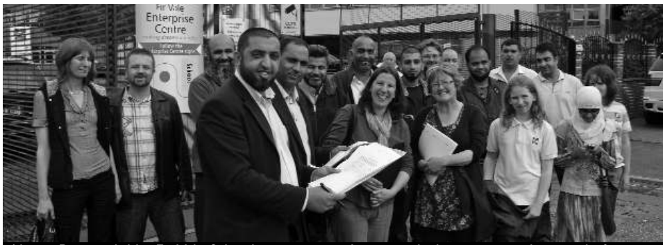
Above: Parents lobby Fir Vale School governors in June to ask them to consult more before making a decision. Below: Parents meet to ask questions and express concerns about academies