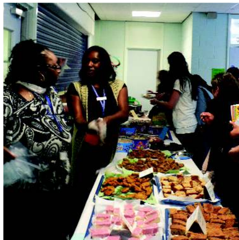
Pye Bank's Summer Fayre See page 14