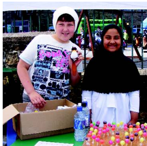
Firs Hill School Summer Fair See page 14