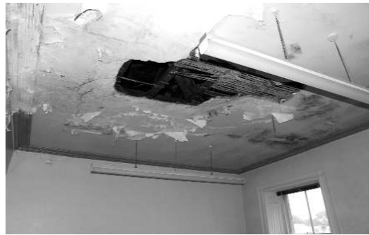
Water damaged ceiling at Abbeyfield Park House