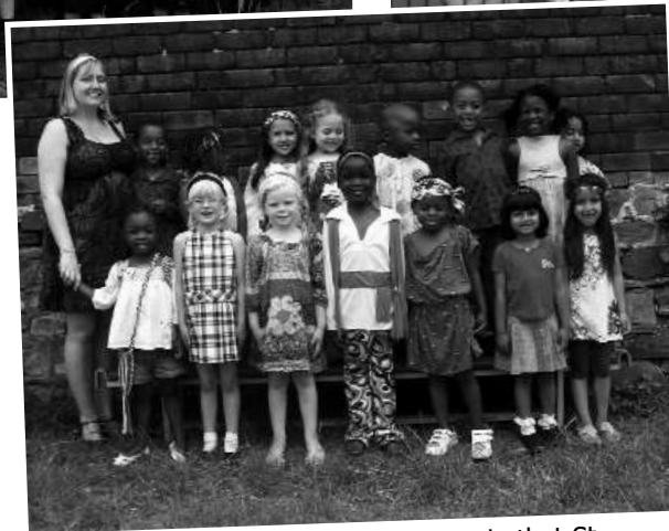
Foundation pupils dress for each decade that St Catherine's has seen.