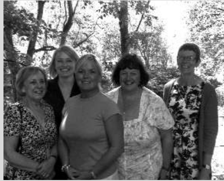
Other funding agreed was:

At the meeting, residents were informed that a decision had already been made to purchase the Burngreave New Deal Consultation Vehicle for £20,000. Some residents at the meeting were not happy with this decision however, it was explained that it is being used as a key element of the assembly's Community Involvement Strategy and the decision to purchase the vehicle had been taken following a full engineer's inspection and a cost-benefit analysis.