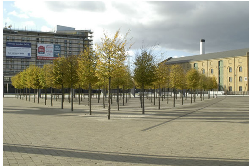
indicative landscape treatment, which softens the hard urban landscape