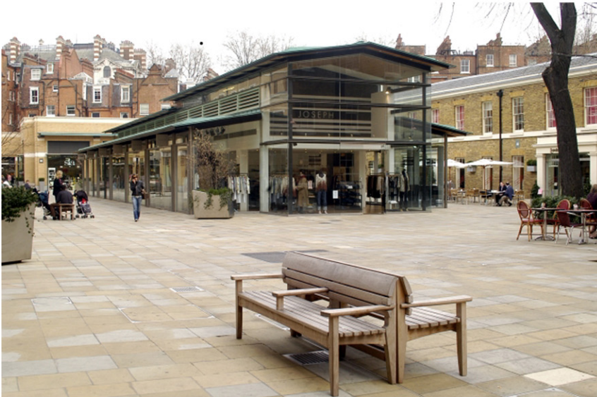
Stanley Square - photograph shows an active square of intimate proportions