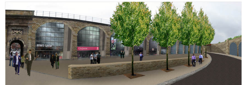
proposed small business units on Walker Street