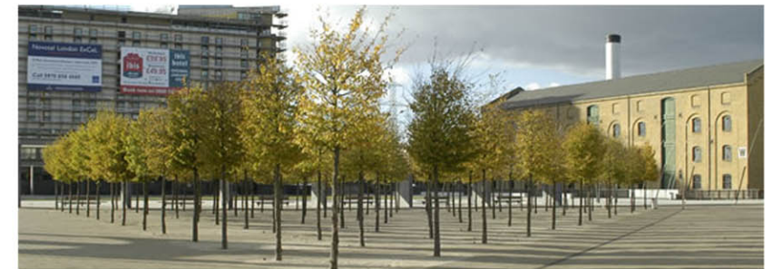
proposed treatment for Stanley Square