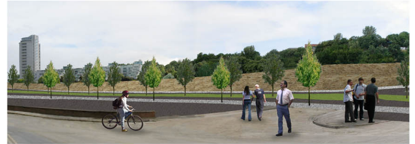
Bridge Houses - potential for a mixed use landmark scheme