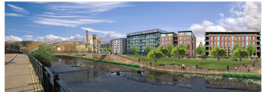
Nursery Street Pocket Park