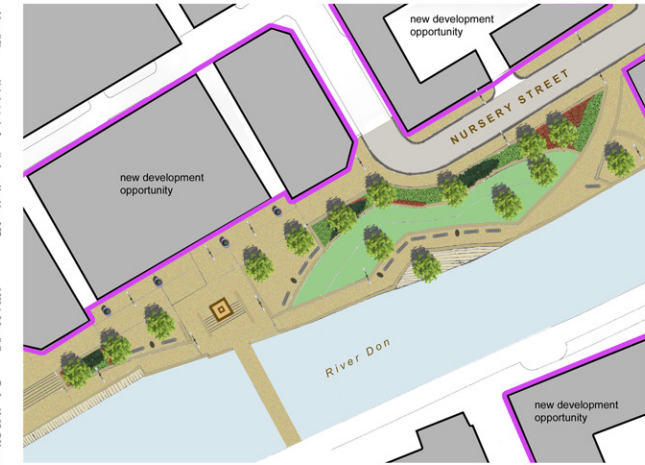
Nursery Street pocket park