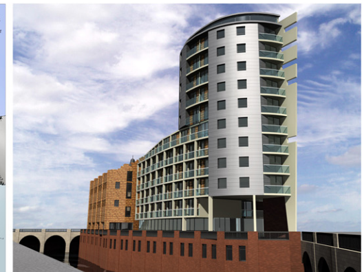
Hancock and Lant Scheme (planning approved)