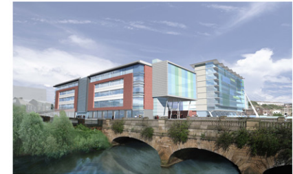
Blonk Street office scheme