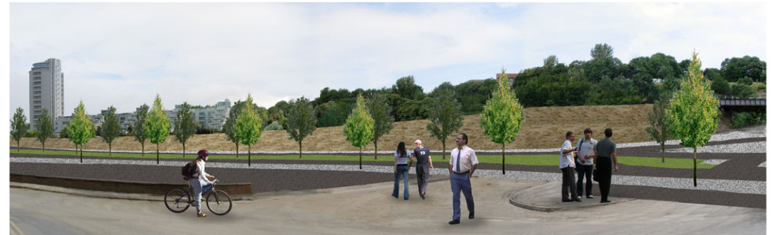
possible development form