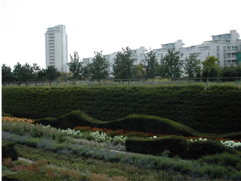
potential development opportunity for a mixed use scheme

a) Development of key sites to create new office developments with some residential in landmark buildings.