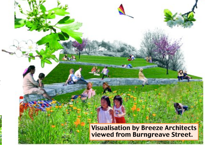
Visualisation by Breeze Architects viewed from Burngreave Street.

The Rec' is a curious combination of football pitch and wildlife haven. Specimen trees such as rauli (a Chilean Beech tree, which is rare in the UK), birch, pine, hawthorn, willow and cherry surround the site and provide homes for nesting birds, insects and snails. The once carefully planned paths and grand steps are overgrown and fear of encounters with shady characters make it under used.