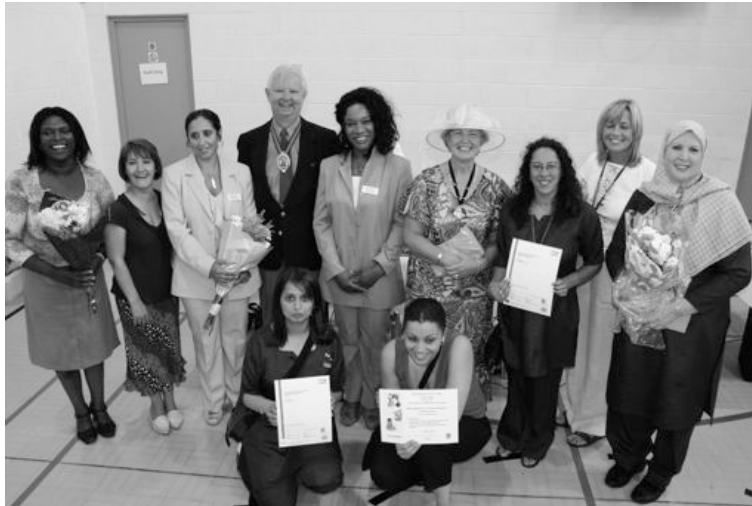
Scene from this year's achievement day.

"The reason the centre is such a success is that there are different services