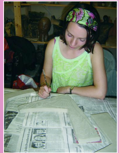
Burngreave residents put the finishing touches to the Islamic art inspired tiles.