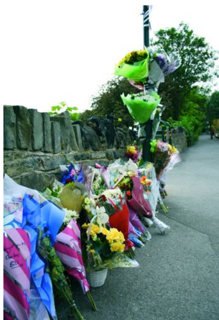
Floral tributes were placed at the entrance to Osgathorpe Park for Ibrahim. Messages included:

An estimated 1,000 people attended the funeral, over a half of these being young people from all over Sheffield. Many commented on the strength of the sermon from the Imam, Maulana Shoaib Desai, who spoke very strongly, setting out the actions needed to be taken in order for young Pakistani