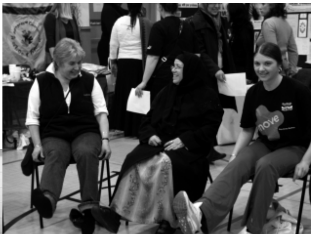
Women enjoying a successful celebration at Verdon Recreation Centre on 8th March.