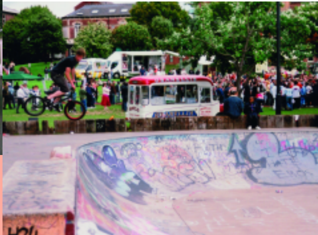
Sunday 28th August the 3DOM Festival returned to Devonshire Green, funded by the Phoenix Development Fund and Burngreave New Deal For Communities the event brought a full day of music, art, dance and sport for the fourth year to Sheffield City Centre.