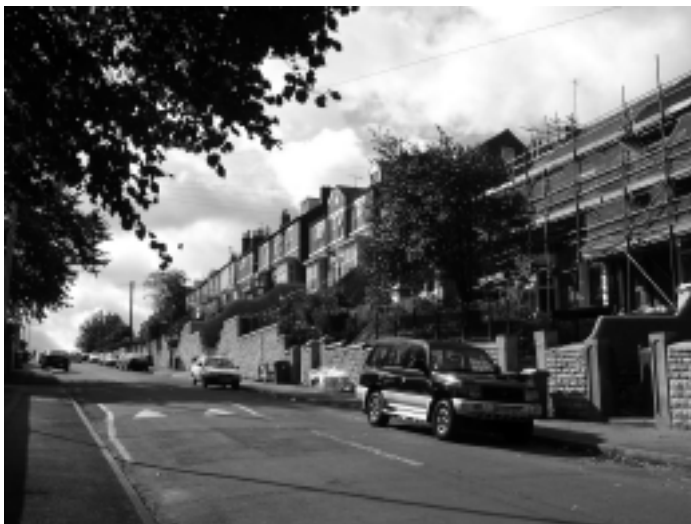
This facelift scheme is funded by New Deal and managed by Sheffield City Council; the contractor is Frank Haslam Milan.

Not only are the residents dealing with poor workmanship, but criticisms and complaints are met with verbal intimidation and threats from the workmen. "When I've tried to speak to