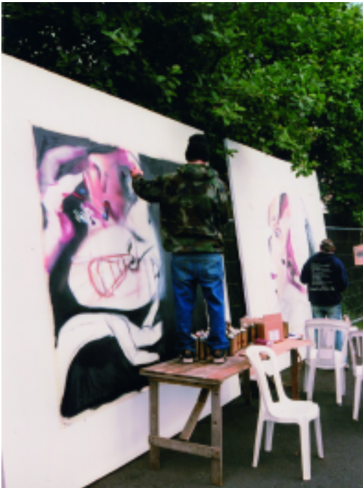
Word Champion Spraycan Artists 'Maclaim' exhibited their talent with Live Spraycan Art creating three stunning canvases in Undercover Corner.