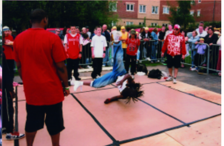
Break and street dancers battled each other for the chance to perform on the main stage and win this year's 3DOM dance trophy.