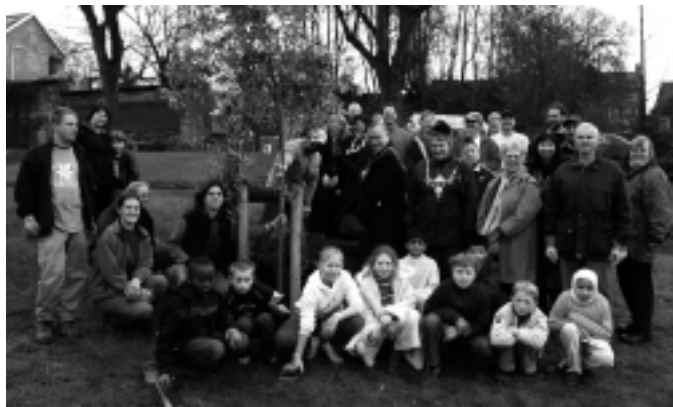
Some of the participants at the One World Tree Planting day in Abbeyfield Park on 27th November 2004.

The Community Forestry Team, based at Meersbrook Park, has decided to rescue their Burngreave Community Forestry project, which includes the One World Tree Project in Abbeyfield Park.