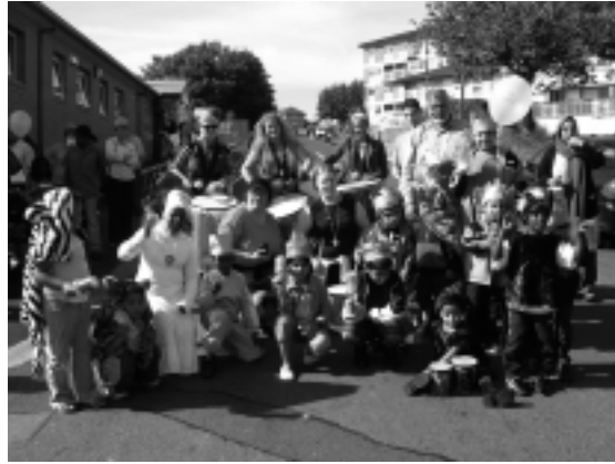
The 24th September opening of Surestart's Burngreave Children's Centre on Spital Street.

Levels of childminders are also low in the Burngreave area, with only 2 places per 100 children in the Burngreave area. Childminding is a vocational career and a childminder is never going to get rich on their earnings, charging £2.50–3.00 per hour per child.