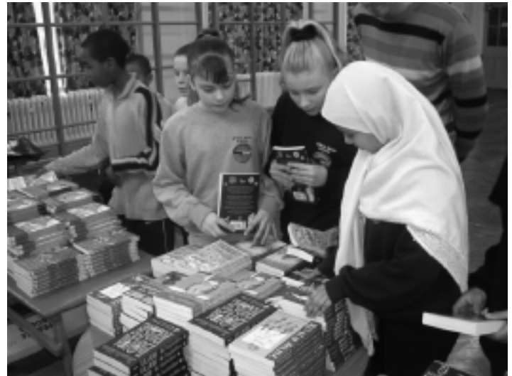
'Burngreave's budding bookworms.' Children from Byron Wood School pick up their favourite books at the BNDfC-funded book fair held at their school.

In addition, a separate initiative in the area has seen BNDfC provide money to local schools so they can buy musical instruments.