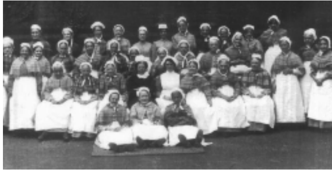
Inmates of the workhouse c 1920.

"Their flat was very clean but lacked any sort of comfort and although the sisters kept themselves tidy, they had very few