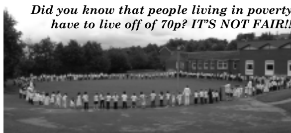
Did you know that people living in poverty have to live off of 70p? IT'S NOT FAIR!!

On Monday, 4th July, St Catherine's Primary School started a week of Making Poverty History. We are trying to put pressure on the G8 leaders to make decisions that will change lives.