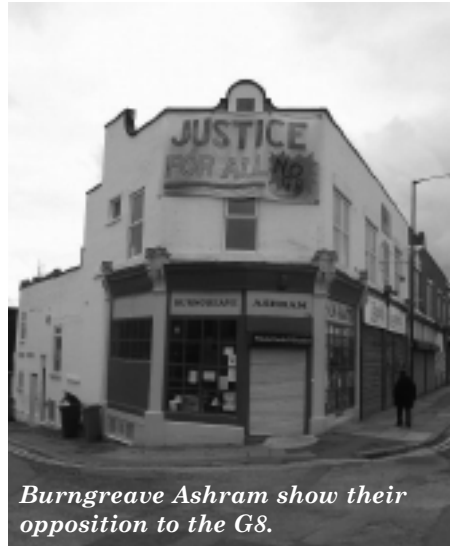
Burngreave Ashram show their opposition to the G8.

The Justice and Interior Ministers of the G8 countries met behind closed doors in Sheffield on 15–17th June. Their agenda was to discuss the 'war on terror' and international crime. Protestors, however, believed that they would use this as an excuse to introduce further moves towards a Big Brother state, including the introduction of compulsory identity cards in Britain. We got a taste of their plans when police banned demonstrations against the G8 ministers, while they wined and dined in Cutler's Hall and the Winter Gardens. With the Pitsmoor Against the War banner at the front, we