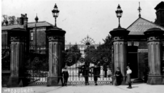
Fir Vale Workhouse Gates.

clothes. Neither of them had ever heard a radio or seen the television. Because their stomachs had become accustomed to the workhouse diet, they were unable to eat normal foods. Bread had to be two days old – eating it fresh would give them stomach ache. Dinner would be boiled mutton with the fat skimmed off and used to make dumplings. For tea they would have bread and jam but the jam would be scraped on and off to make it last longer. And when they received their £10 Christmas bonus for the first time, they said they had never had so much money before and felt they should save it towards their funerals. But they always said of the workhouse: 'We were fed, had a clean bed and a roof over our heads so we were lucky really!'