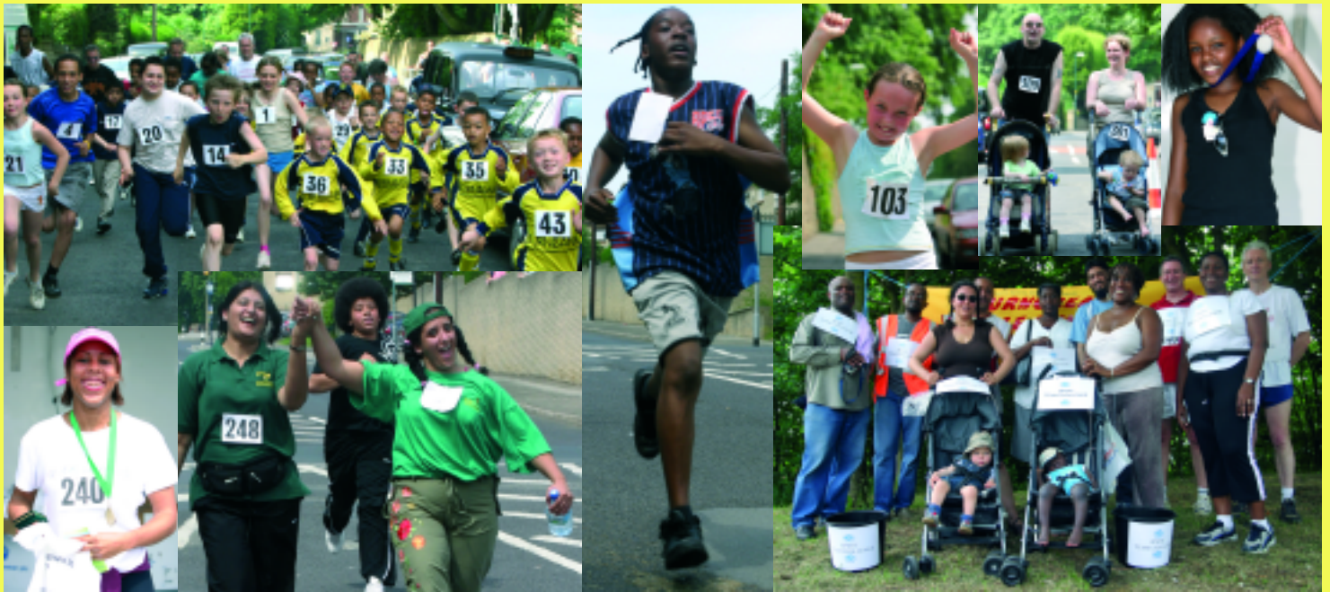
All © Carl Rose